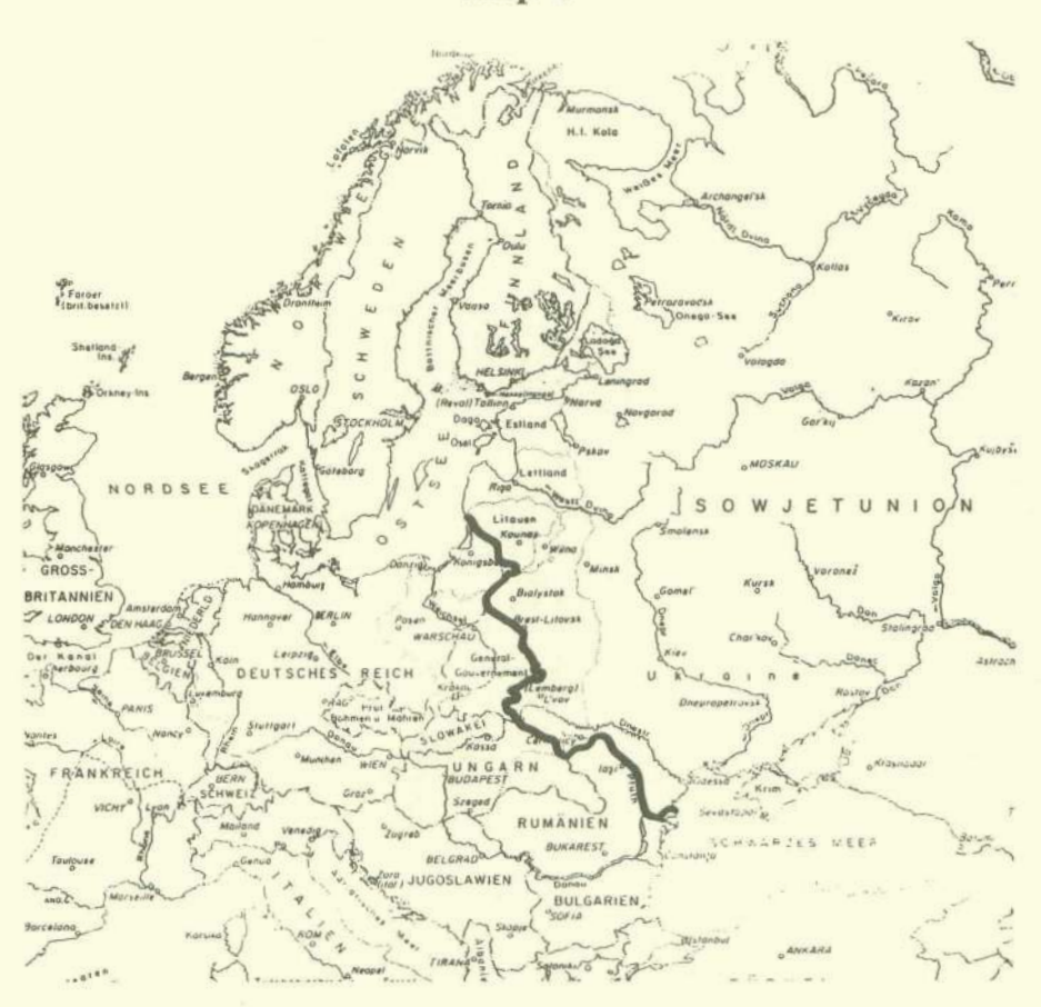
German-Soviet demarcation line as of the end of November 1940.